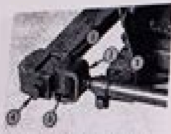
Fig. 21 - Knife Indexing Adjustment