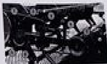
Fig. 23 - Reel Drive Belt