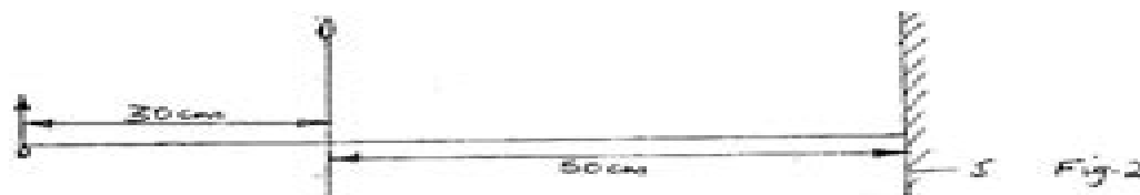
Figure 2 drawn to scale shows a lens L1 placed 30cm from an object O. The image is formed on the screen S 50cm from the lens.