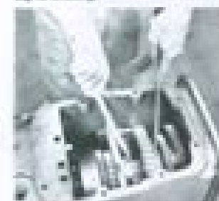
Fig. 204—Pto mainshaft removed as shown in the first drawing from here in transmission case

Remove cover plate (28—Fig. 203) from front of housing and remove snap ring (29) and thrust washer (30) from front of pin shaft. Thread two 1/8 inch 170" cap screws into tapped holes in rotation housing (30) and tighten evenly to pull housing with bearing from pin shaft. Remove pin shaft rearward from housing and lift drive gear out top opening of housing.