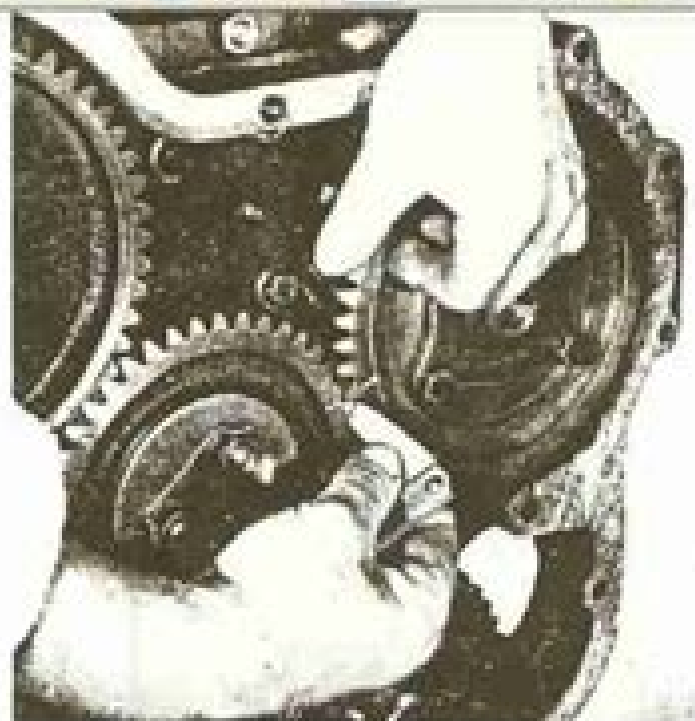
Fig. 36 - Measuring Timing Gear Backlash