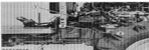
(1) Rubber Hose (2) GST Delivery Pipe (3) Delivery Pipe (4) Brake Rod