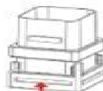
Steps C-F – Clean Windows