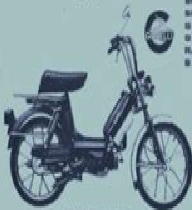
GRAN SPORT LTD