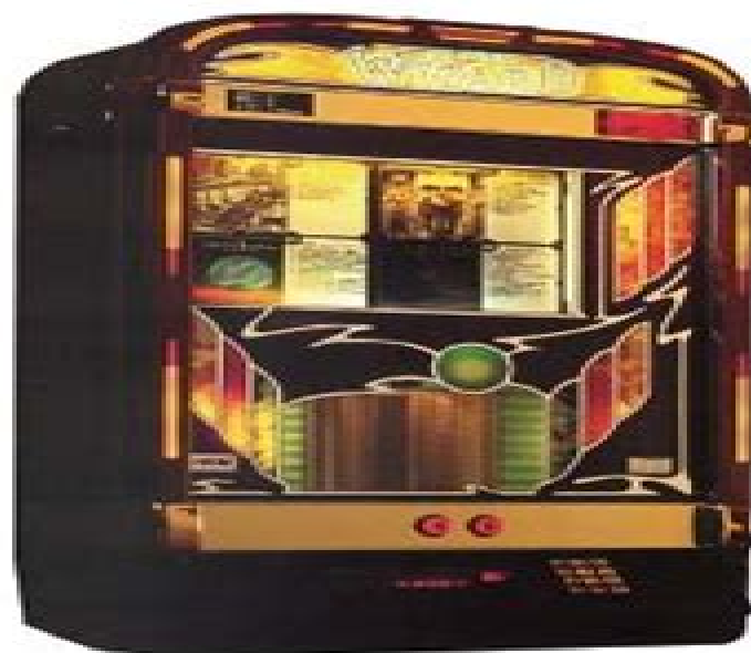
Wizard und Old Fashion Wizard 1992-1995