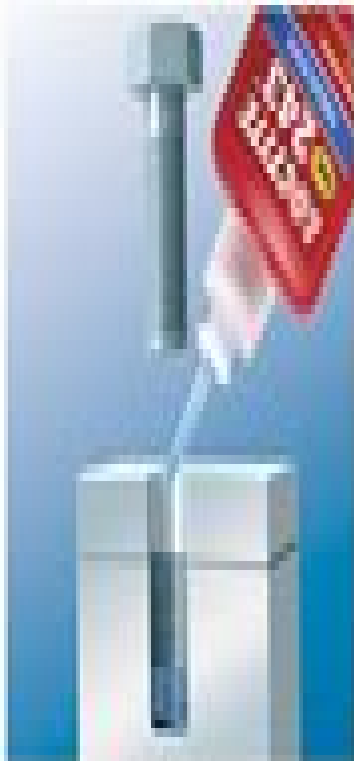
For blind holes