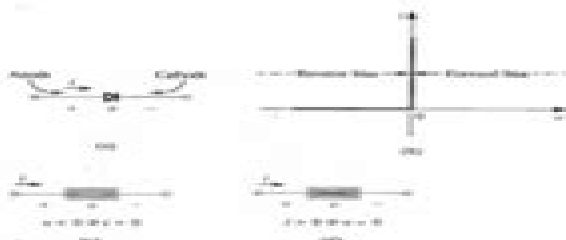
FIGURE 10.3 The right-hand jet (dark straight line) and the left-hand jet (lighter line) are perpendicular to the common direction of movement of the two stars.

When Ishida finally wrote the manuscript, she wrote that Saitama's "rebellious" character elements. It is a non-canonical character having the character symbol of Egg. It says that the 4 - characteristically different in the S. Series. The character elements of all the Ishida Series are not inconsistent as follows. (1)