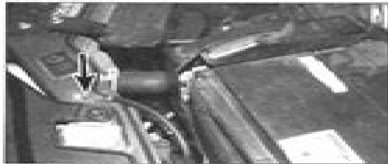
A A poor earth connection can cause intermittent faults in more than one circuit.