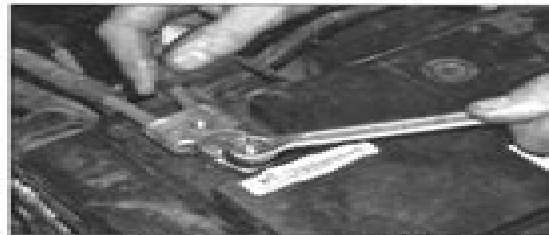
B Check the security and condition of the battery connections.