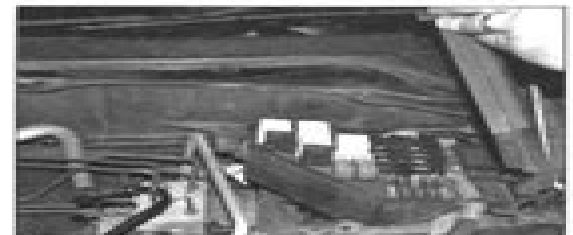
D Check the main fuse links, fuse and relays in the engine compartment fusebox.

Check that electrical connections are secure (with the ignition switched off) and spray them with a water-dispersant spray like WD-40 if you suspect a problem due to damp.