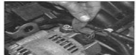
C Visually check engine harness connections/multipugs, including the alternator connectors.