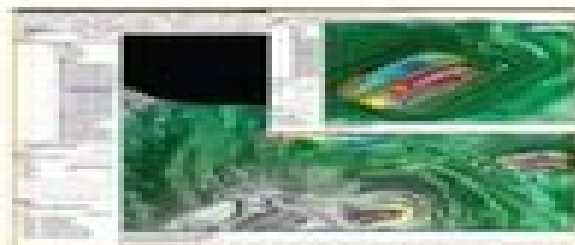
Может быть создан план разработки, на основе существующих производственных очередностей.