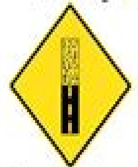
Paved surface ends