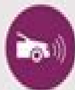
Secured automotive sensor fusioning