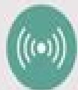
Secured IoT end node sensors