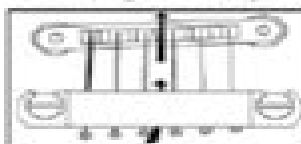
Bridge Stringing - Forward/Backward

Proper string installation is critical to the playability of your instrument. An incorrectly installed string can slip and cause the instrument to go out of tune. When changing strings, it is recommended changing one string at a time in order to maintain tension on the neck and bridge. The pressure of the strings holds the bridge and saddles in place, and removing all the strings could necessitate a new setup.