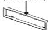
Mounting hardware Assy (J21-9716-03)