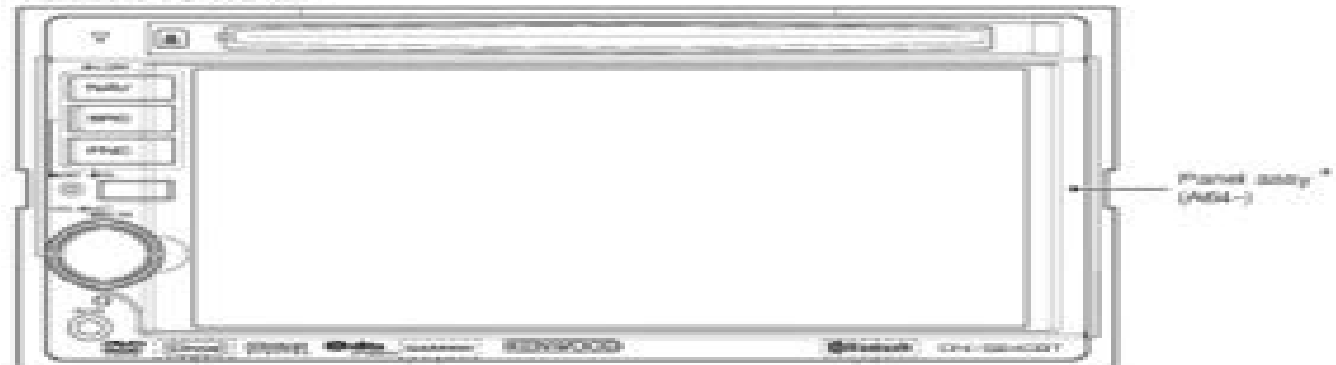
Illustrations to DDX5240BT

© 2006-11 PRINTED IN JAPAN B53-0693-00 (N) 429