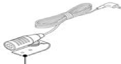
Microphone (3m) (W01-1676-05)