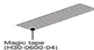
Magic tape (H30-0600-04)

About removing the 2 hexagonal head screws : "TORX T8 Screwdriver" is necessary.