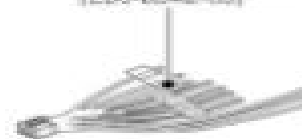
Mounting hardware Assy (J22-0171-03)