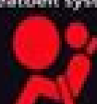
Airbag and seatbelt system