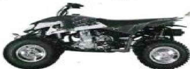
OUTLAW 525 IRS