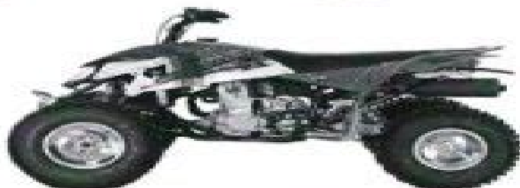
OUTLAW 525 S