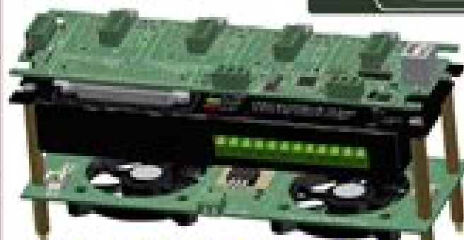
GRBL G540 shown installed atop gecko G540 and fan plate