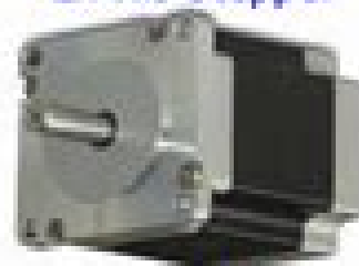
Z Axis Stepper