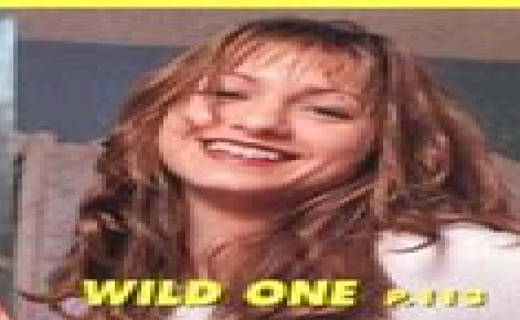
WILD ONE P.102