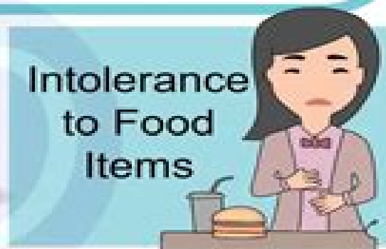
Intolerance to Food Items