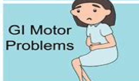
GI Motor Problems