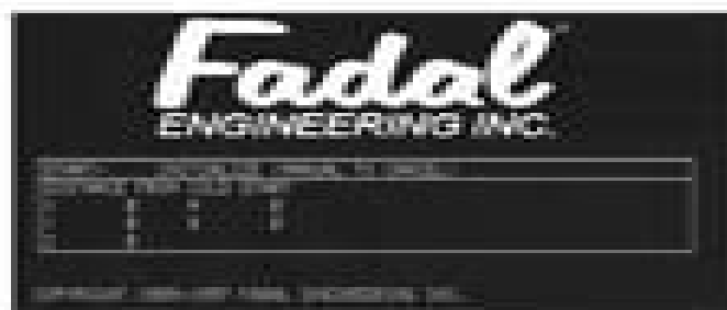
Figure 1-6 Screen display following power-on.

The Fadal logo will display on the monitor screen of the pendant when the VMC is powered on (See Figure 1-6).