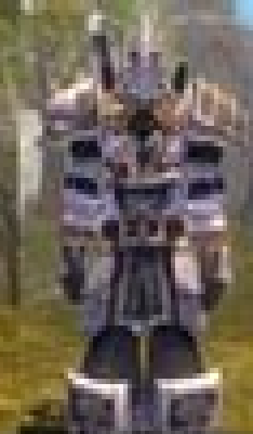
Arthur's Battle Armour