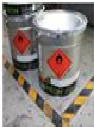
Operational Areas Keep Clear