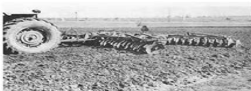
MF 520 WHEELED TANDEM DISC HARROW