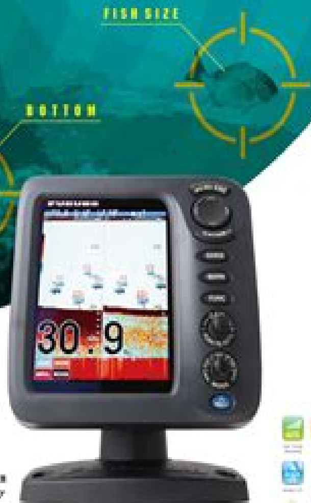
5.7" Color LCD FISH FINDER — FCV-627