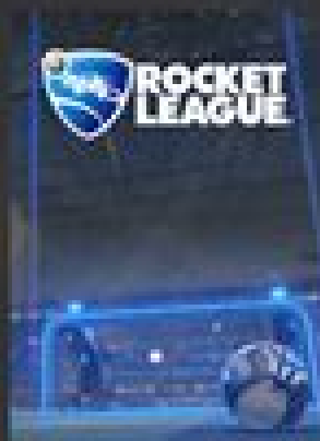
Rocket League 4 install