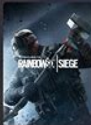
Rainbow Six Siege 4 install