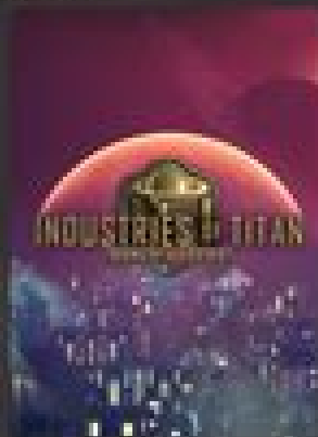
Industries of Titan 4 install