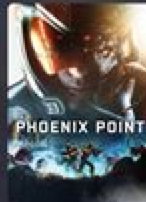
Phoenix Point 4 install