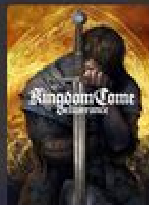
Kingdom Come: Deliverance 4 install