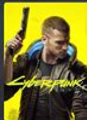
Cyberpunk 2077 4 install