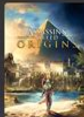
Assassin's Creed Origins 4 install