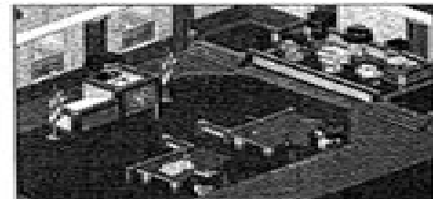
Which roles do you recognize?

The trial court is the first court to hear a case. Both the state and federal systems have trial courts. In the Federal system, the trial court is called a District Court. In the trial court, lawyers use evidence to try to prove that their client's side of the story is what really happened. Evidence can be almost anything—witnesses, videos, photographs, a letter, a piece of fabric, or even a murder weapon! In a jury trial , a group of twelve people listens to the evidence and decides who wins the case. That decision is called the verdict . In a bench trial there is no jury, so the judge gives the verdict.