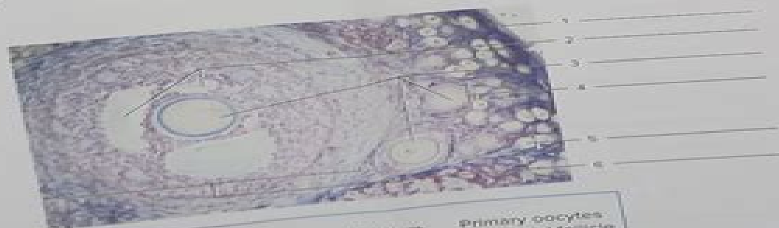
FIGURE 60.13 Label the micrograph of a section of an ovary, using the terms provided. (See text; follicles do not migrate through an ovary.)