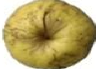
Apple Golden 1