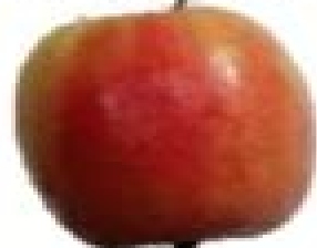
Apple Pink Lady