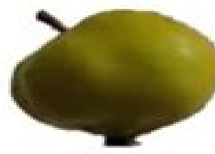
Apple Red Yellow 2