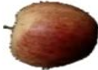
Apple Red 3