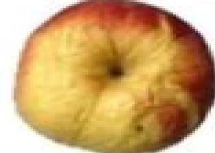
Apple Red Yellow 1