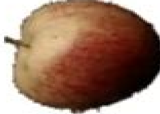
Apple Red 3