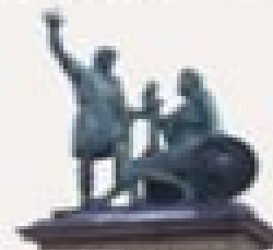
Monument to Minsk and Pozharskiy

A bronze statue of the hero Minsk depicts Ivan Pozharskiy from the Time of Troubles (1605-16), the father of Russia's Minsk and Pozharskiy Districts. They raised a volunteer force to fight the invading Poles and, in 1612, achieved victory when they drove the Poles out of the Kremlin. The statue was erected in 1916 in the triumphal archway of the Napoleonic Wars. Originally placed in the centre of Red Square facing the Kremlin, it was moved to its present site in front of St Basil's during the Soviet era.