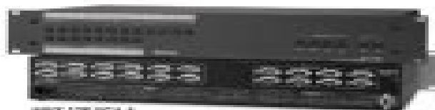
MVX 12x12 VGA A