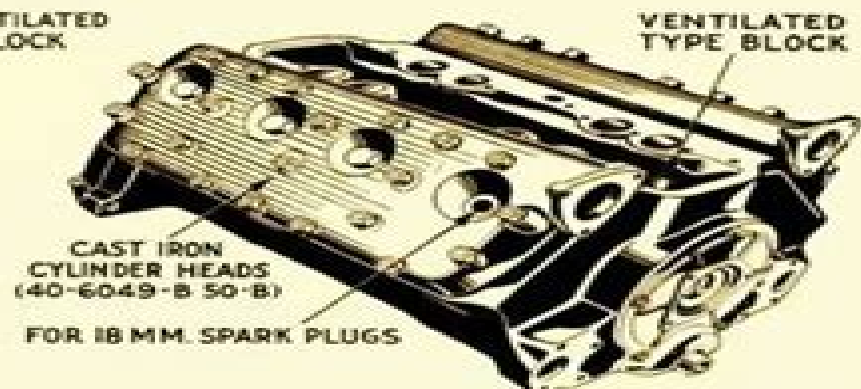
51-6012—(FOR 1935, 1936 TRUCKS)