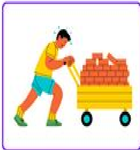
Newton's First Law of Motion

Newton's Laws of Motion comprise three fundamental principles that describe the relationship between the motion of an object and the forces acting on it. These laws help explain how objects move in our everyday world and in the universe.