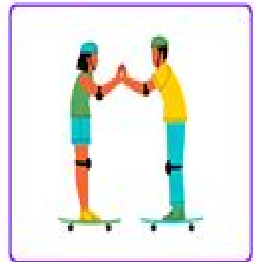
Newton's Third Law of Motion