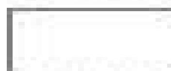
Diagram of the brain

The text tells us about the importance of the brain, and how the brain is the most important part of the body. It also tells us about the different parts of the brain and how they work. The text is a good example of a scientific text, and it is written in a clear and concise way. The text is divided into three parts: the first part introduces the topic, the second part explains the different parts of the brain, and the third part discusses the importance of the brain.