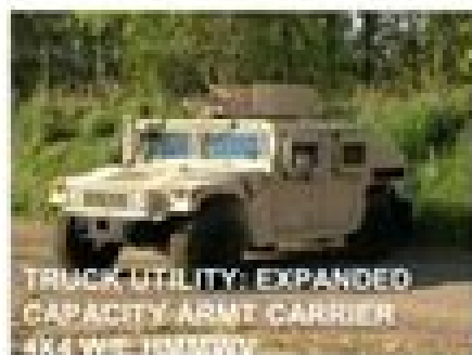
M1151A1 (LIN T34704)