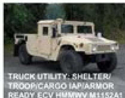
M1152A1 (LIN T37588)

M1152A1 replaces M1037, M1097, M1113, and most M998, M1038