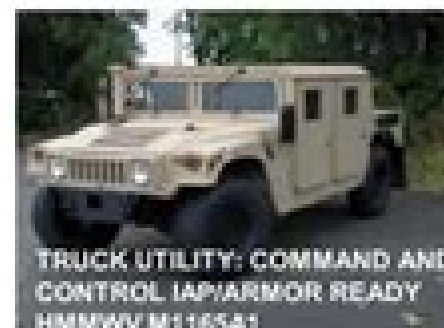
M1165A1 (LIN T56383)

M1152A1 replaces M1037, M1097, M1113, and most M998, M1038