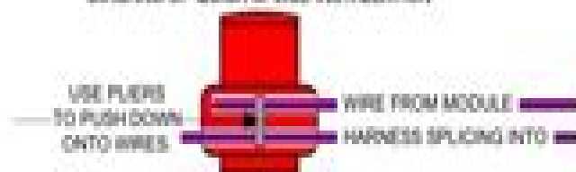
DIAGRAM OF QUICK SPLICE INSTALLATION