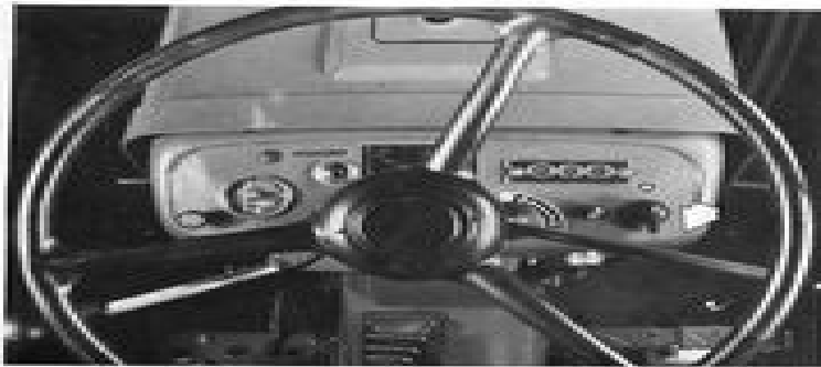
Figure 7 — Hand Throttle