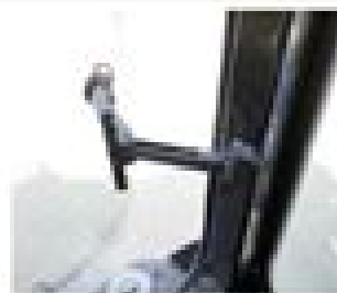
Window is closed

Pull the lever ( 4 ) and push to open the rear window.