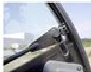
Window is closed

To unlock the opened window press the unlocking button ( 2 ) from inside the cabin.