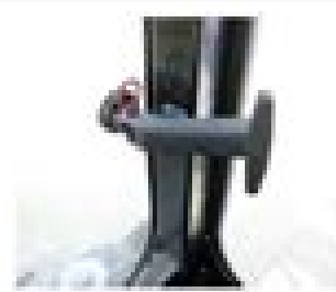
Window is opened