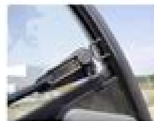
Window is opened