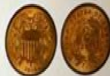
Two Cents, Three Cents & Half Dimes