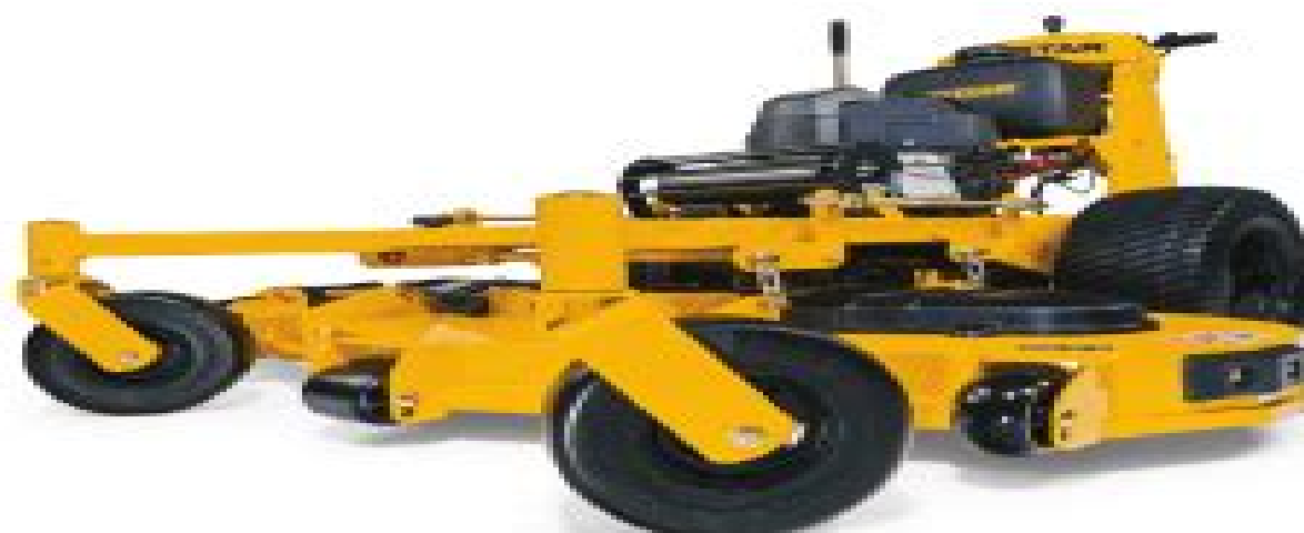
AVAILABLE DECK SIZES