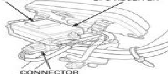
ANTENNA GPS RECEIVER

Install the receiver with the antenna side facing up.