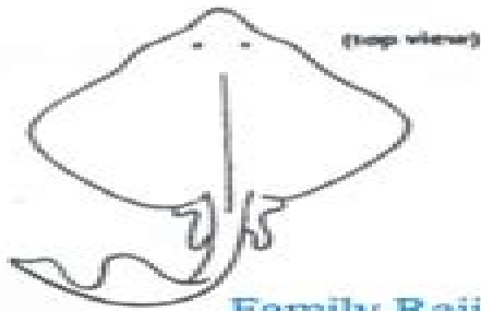
1 Family Rajidae