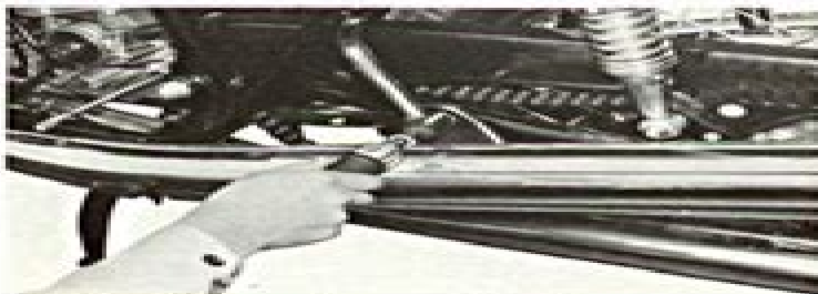
Fig. 7-1-22 Removing rear footrest