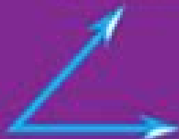
Acute Angle (less than 90°)