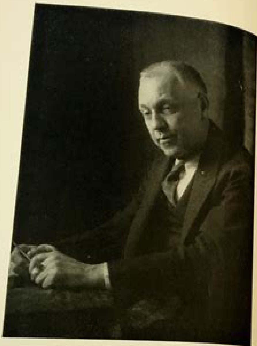
CLAUDE BRAGDON