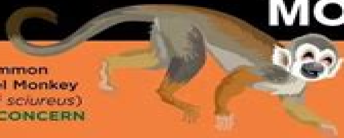
Common Squirrel Monkey ( Saimiri sciureus ) LEAST CONCERN

The Common Squirrel Monkey is an example of a New World Monkey